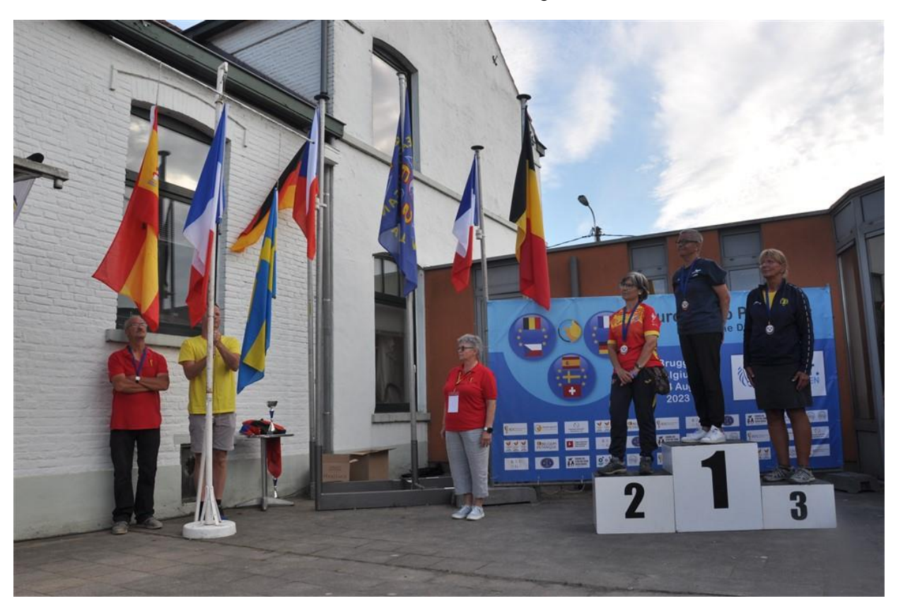
Podium Single Women