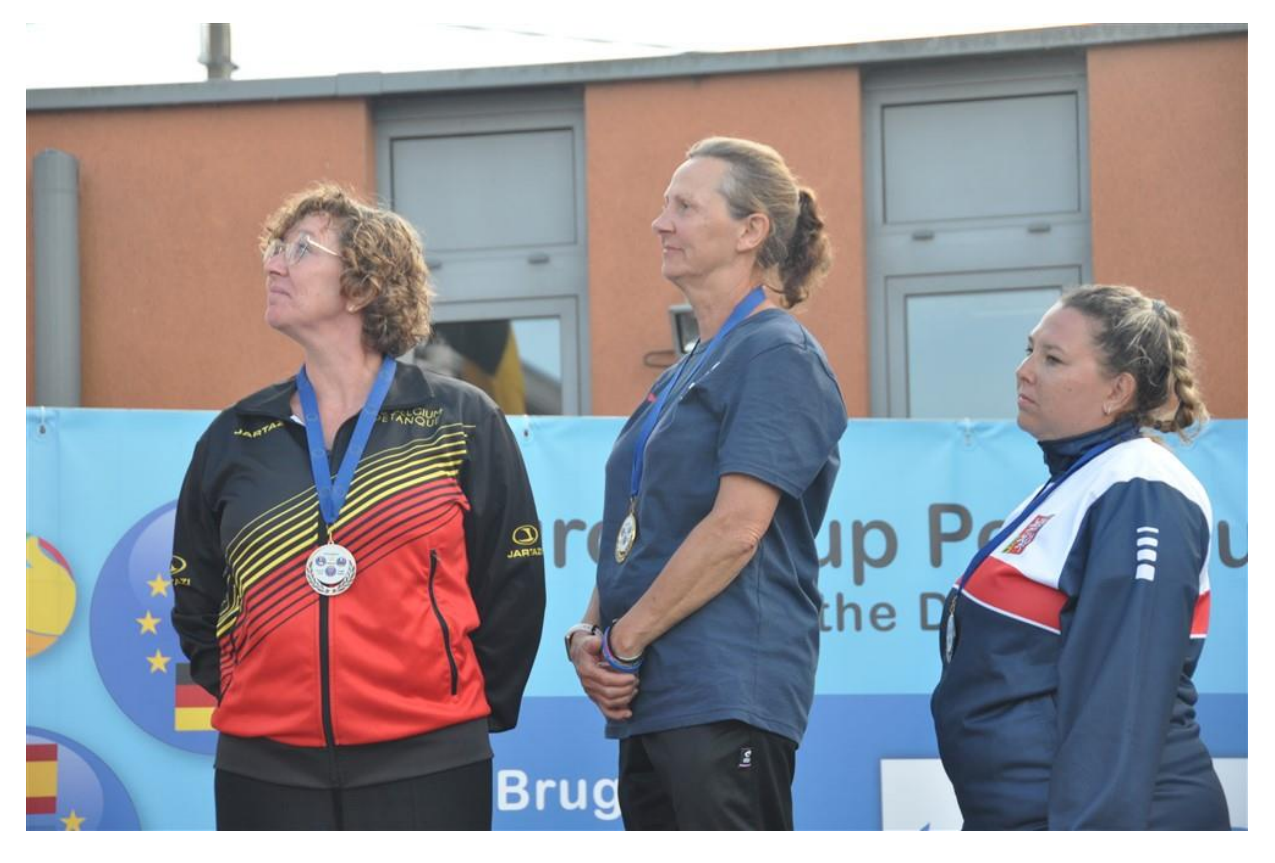
Podium Precision Shooting Women

Bruges Alderman Culture Nico Blontrock was the guest of honor at this European Cup today.