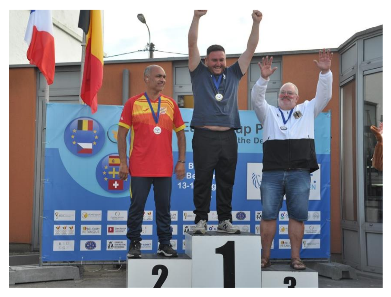
Podium Precision Shooting Men