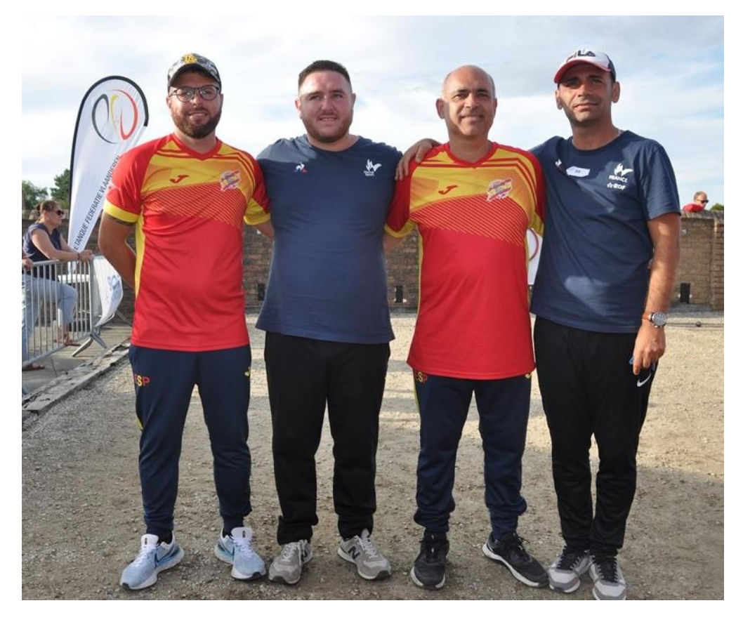
Men's Final Double: France - Spain