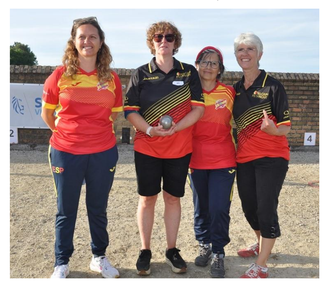
Women's Final Double: Belgium - Spain