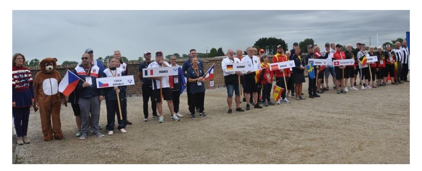
The participants of this European Cup at the opening ceremony