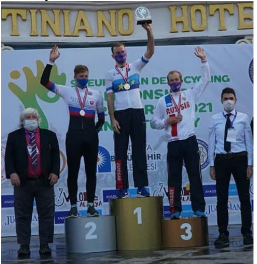
Individual Time Trial