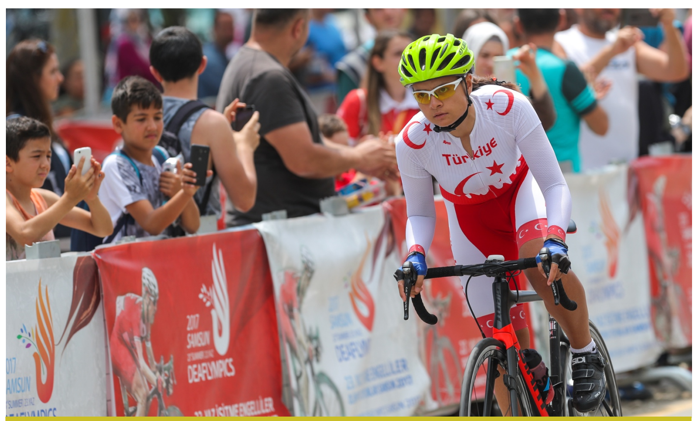
You can find more information about visa regime of Turkey at: www.mafa.gov.tr and www.evisa.gov.tr

Visa nationals and non-visa nationals can enter the Turkey as visitors for the purpose of taking part in sporting events, including as participants, officials, team support staff, accredited media and VIPs, as permitted by the visitor rules.