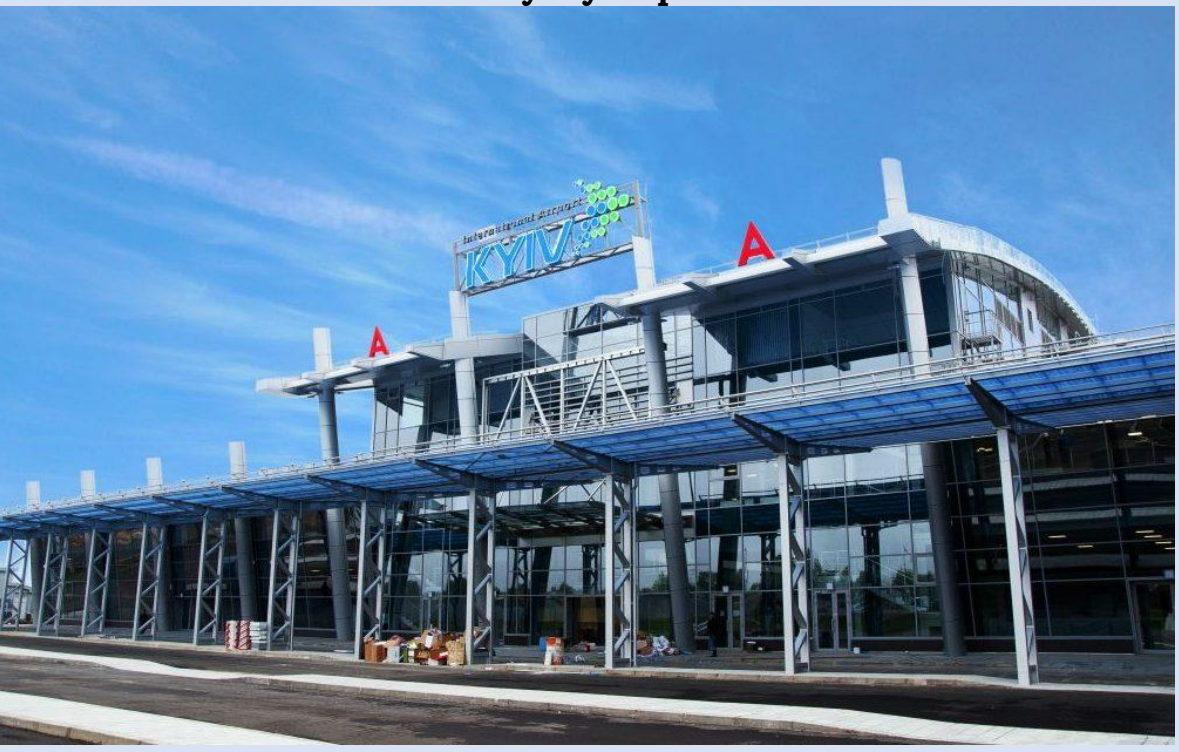
There are also railway and bus stations of international flights in Kiev.