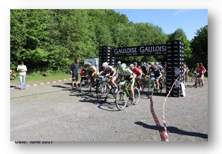
Cross Country XCO and Team Relay XCR