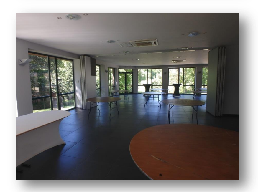
Closing ceremony, Banquet