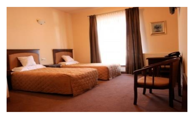
VICTORIA Hotel See here: <u>http://www.victorialublin.pl</u>